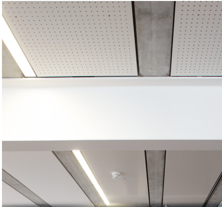
This photo depicts Décortech MDF with Décortech Factory Applied White Satin Finish