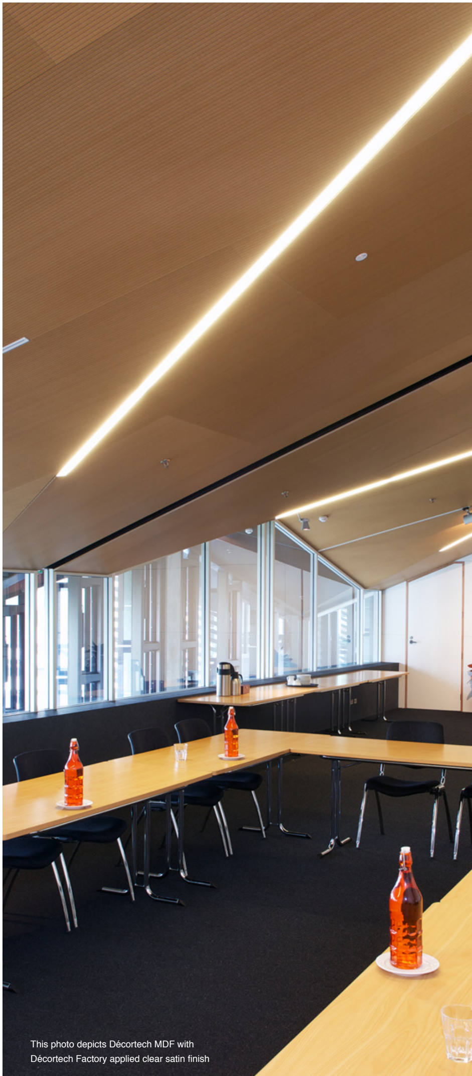
This photo depicts Décortech MDF with Décortech Factory applied clear satin finish